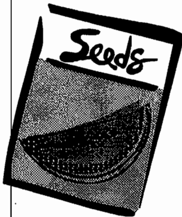
Time to work on the garden spot again ...